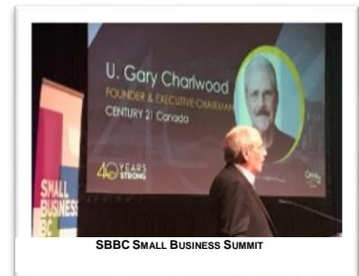
SBBC SMALL BUSINESS SUMMIT