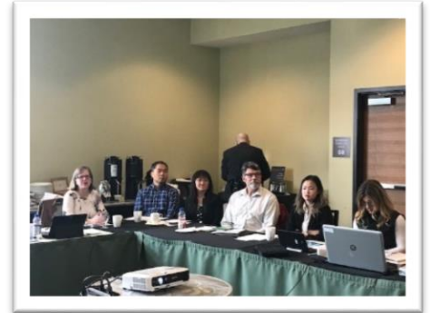
Attendees from Western Economic Diversification