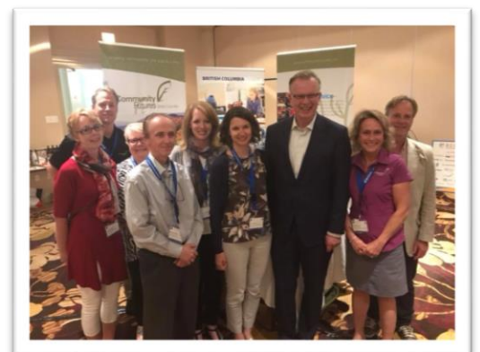
The CFBC Wavemakers Group with Minister Ralston