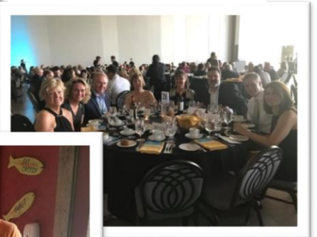
Hanging out with Olympic medalist John Montgomery