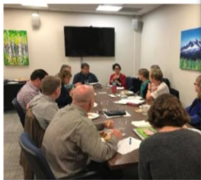
CFBC Board Meeting