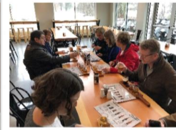
Begbie Brewing Company