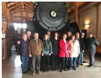
Revelstoke Railway Museum